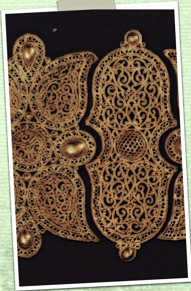
A GOLD BELT OR COLLAR

ABD AL-MALIK TOOK A REAL INTEREST IN ASHKELON, A PORT CITY ON THE MEDITERRANEAN SEA WHICH WAS CONTROLLED BY THE BYZANTINE EMPIRE. HE STRENGTHENED THE CITY'S FORTIFICATIONS AND ENCOURAGED RETIRED SOLDIERS TO SETTLE IN AND AROUND THE CITY BY GIVING THEM LAND. ASHKELON WAS PART OF THE ISLAMIC EMPIRE FROM 640 C.E. UNTIL 1153 C.E.