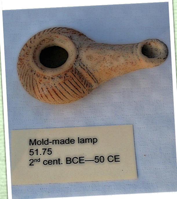
Mold-made lamp 51.75 2 nd cent. BCE—50 CE

CLEOPATRA FLED TO ASHKELON AND TRIED TO RAISE TROOPS AFTER FIGHTING WITH HER BROTHER FOR CONTROL OF THE EGYPTIAN THRONE. CLEOPATRA LIVED IN THE 1ST CENTURY B.C.E.