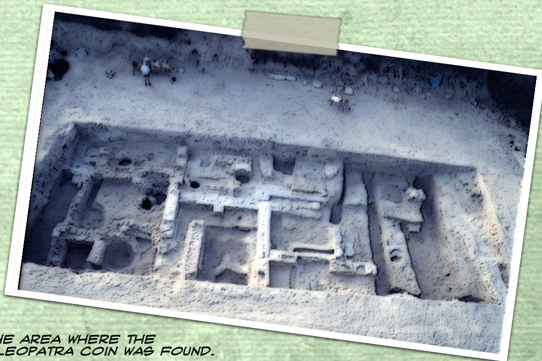
THE AREA WHERE THE CLEOPATRA COIN WAS FOUND.