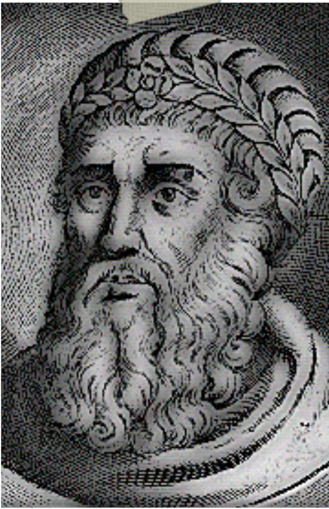
HEROD THE GREAT, RUMORED TO HAVE BEEN BORN IN ASHKELON, BUILT A PALACE FOR AUGUSTUS.