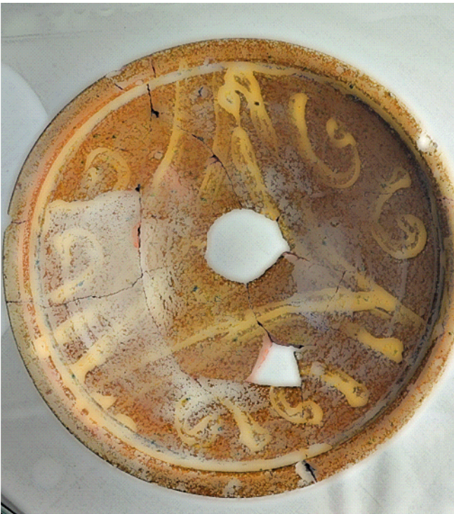
A CRUSADER PERIOD BOWL. THE CRUSADERS WERE IN ASHKELON FROM 1153-1187 AND AGAIN IN 1192 AND FINALLY THE 1240s.