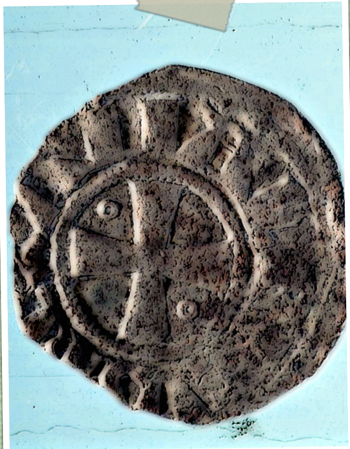
A CRUSADER COIN