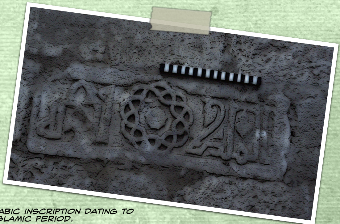
AN ARABIC INSCRIPTION DATING TO THE ISLAMIC PERIOD.