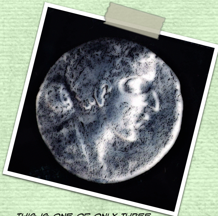
THIS IS ONE OF ONLY THREE KNOWN COINS DEPICTING CLEOPATRA.