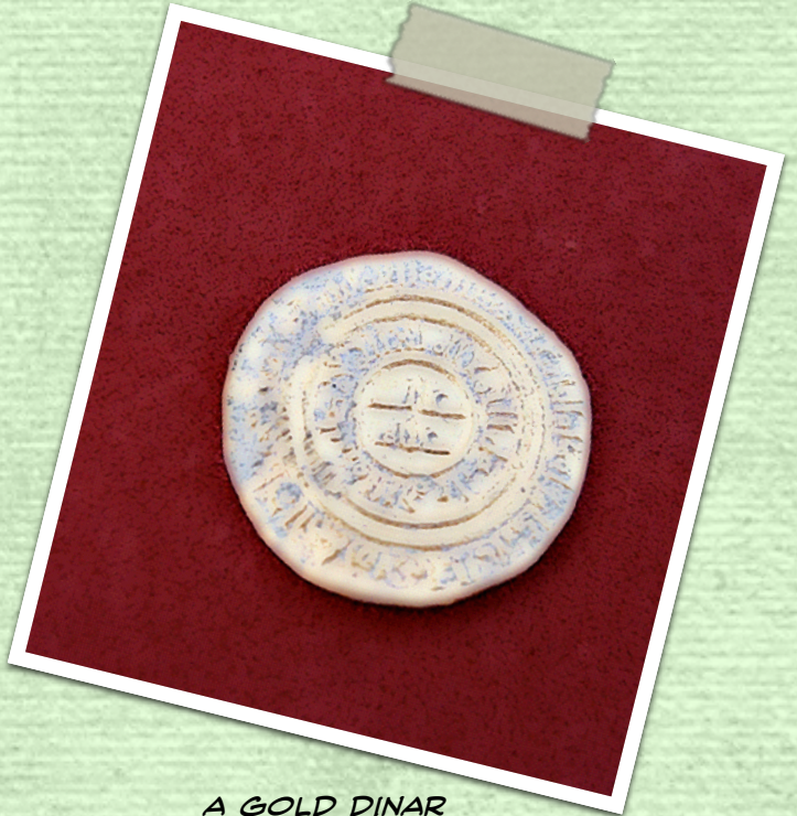
A GOLD DINAR