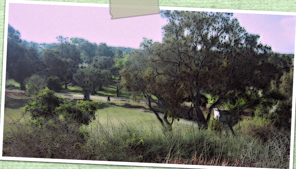
WE DON'T KNOW WHERE THE PALACE WAS LOCATED. WE HAVE NEVER FOUND ANY EVIDENCE OF IT. ASHKELON WAS PART OF THE ROMAN EMPIRE FROM THE 1ST CENTURY B.C.E UNTIL 330 C.E.